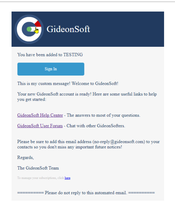
Include a customized note in an email to new people!

Customize your Welcome Message ... Add a message unique to your organization, to go along with links to sign in, the Help Center and the Forum.